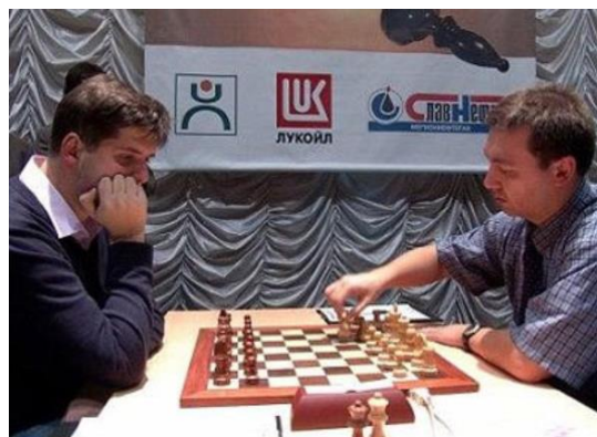
Svidler - Kamsky